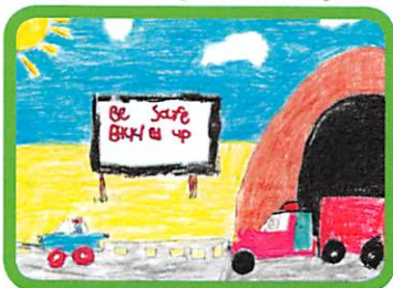
Trucks and buses take longer to stop.