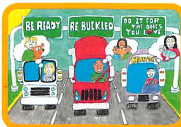
Drivers and passengers practice road safety by wearing seat belts.